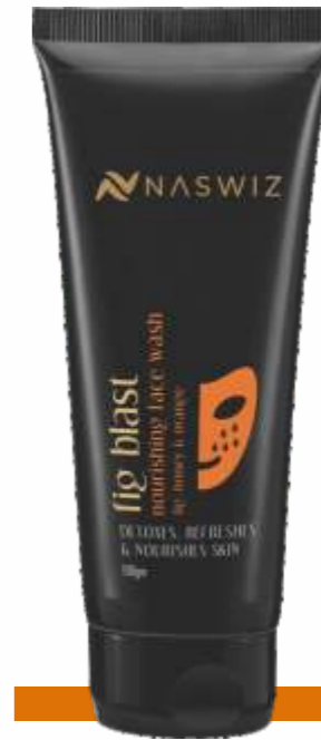
fig blast nourishing face wash

FIG, HONEY & ORANGE CLEANSES, REFRESHES & NOURISHES SKIN